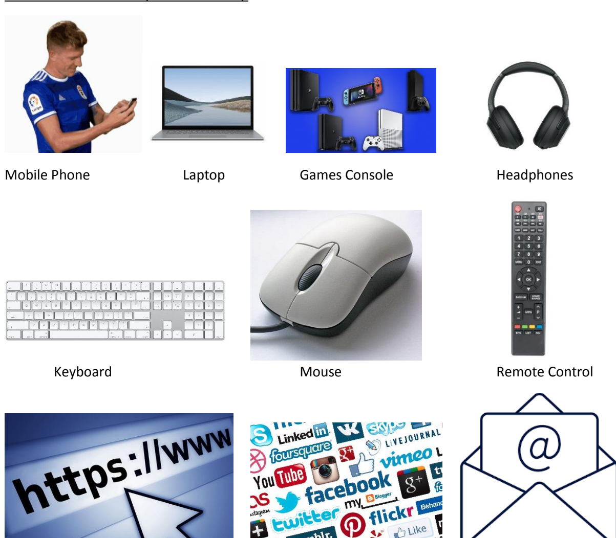
<u>Exercise 2 – After looking at the vocabulary in exercise 1, I recommend these websites</u> <a href="https://learnenglishkids.britishcouncil.org/word-games/technology">https://learnenglishkids.britishcouncil.org/word-games/technology</a> - A vocabulary exercise <a href="https://learnenglishkids.britishcouncil.org/es/video-zone/minecraft-taught-school">https://learnenglishkids.britishcouncil.org/es/video-zone/minecraft-taught-school</a> - A listening activity about Minecraft